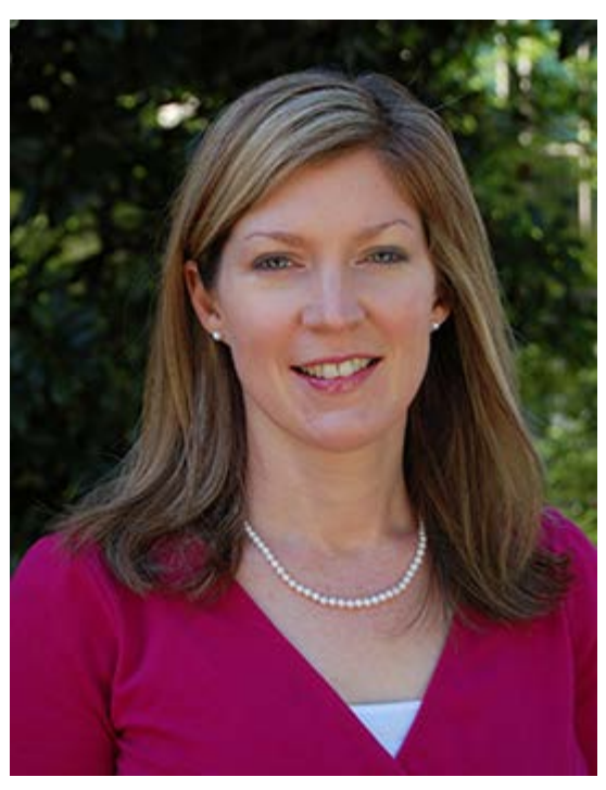
Jennifer Elder