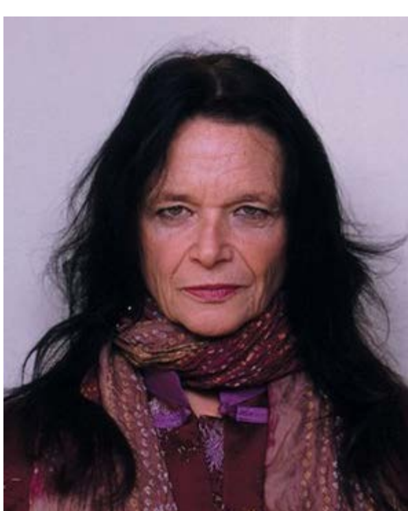
Anne Waldman.

Beat poet, activist, performer, and professor Anne Waldman will join the Emory community for three events to mark the opening of "The Dream Machine" exhibition.