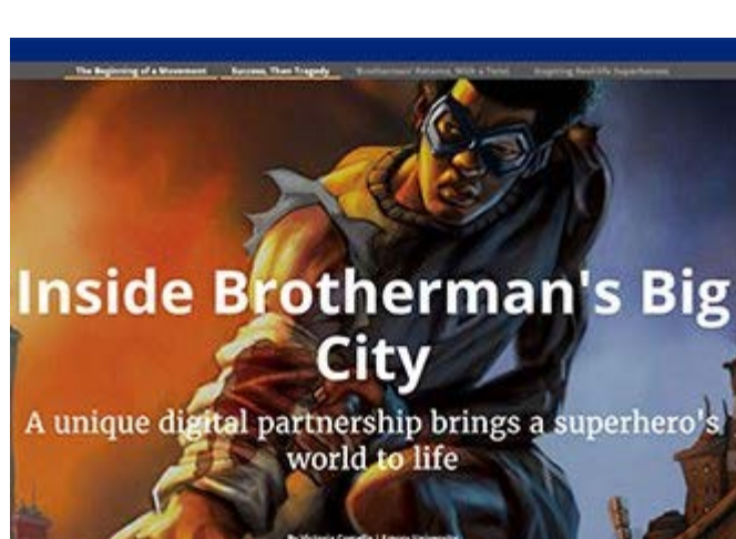
A unique digital partnership brings a superhero's world to life

We're making headlines in Atlanta and around the world: