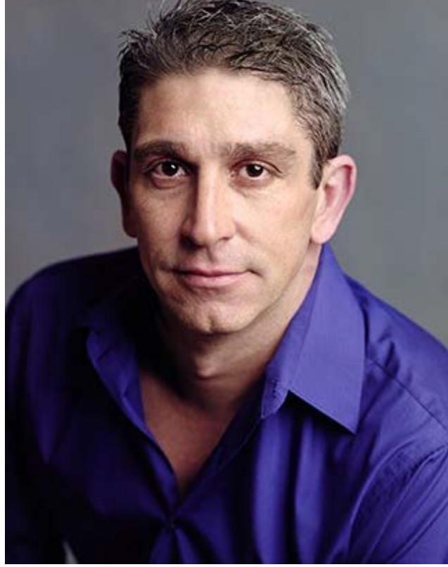
Richard Blanco.

Richard Blanco, who presented his poem, "One Today," at the second inauguration of President Barack Obama in 2013, has placed his papers with the Stuart A. Rose Manuscript, Archives, and Rare Book Library.