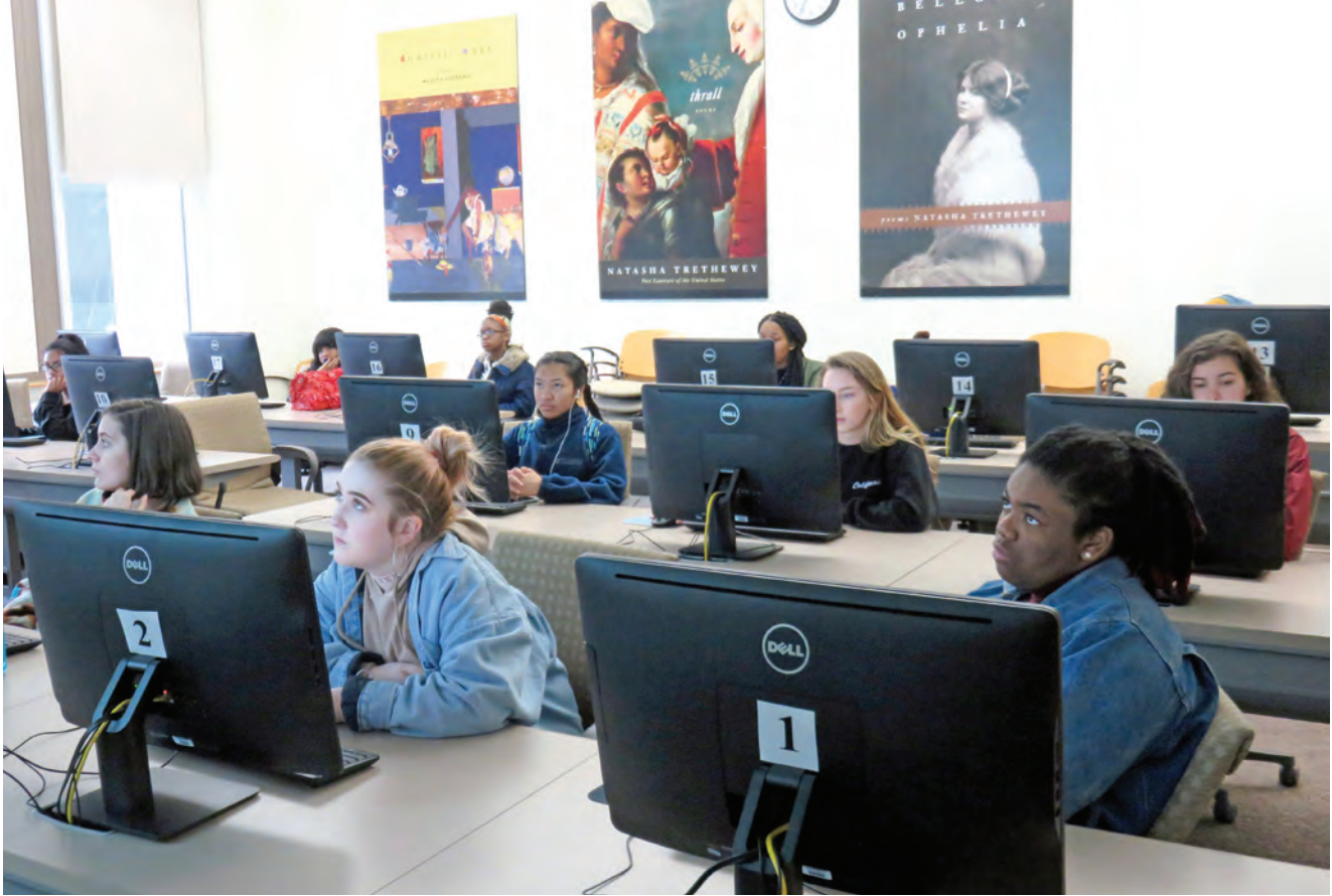
Students in the International Baccalaureate program at Maynard Jackson High School visit Woodruff Library at least twice a year to work on their research papers.