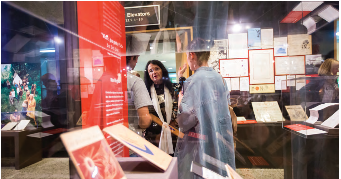
Beat poet Anne Waldman, center, talks with guests at the September opening celebration for the exhibition (above) and signs a broadside of one of her poems (right).

“The Rose has long been committed to bringing students into the archives, and in this class, students will have the chance to engage directly with our fabulous collections and to make a genuine scholarly contribution to our understanding of the Beat Generation.”