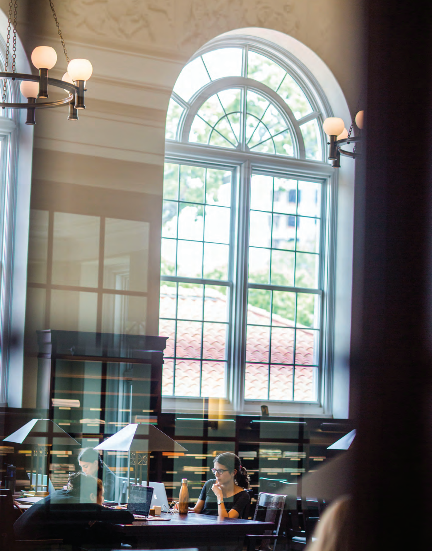
Matheson Reading Room, Robert W. Woodruff Library