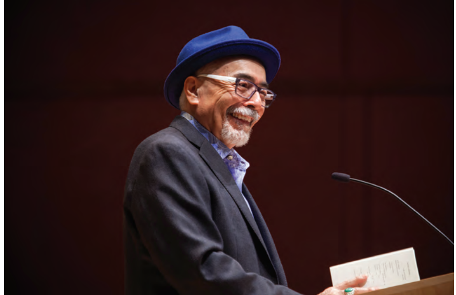
Juan Felipe Herrera (above), who gave a free reading this year, was the sixth US poet laureate to be featured in our Raymond Danowski Poetry Library Reading Series, following a 2016 appearance by Rita Dove (below).

For more about events and exhibitions at the Emory Libraries: emorylib.info/news-events .