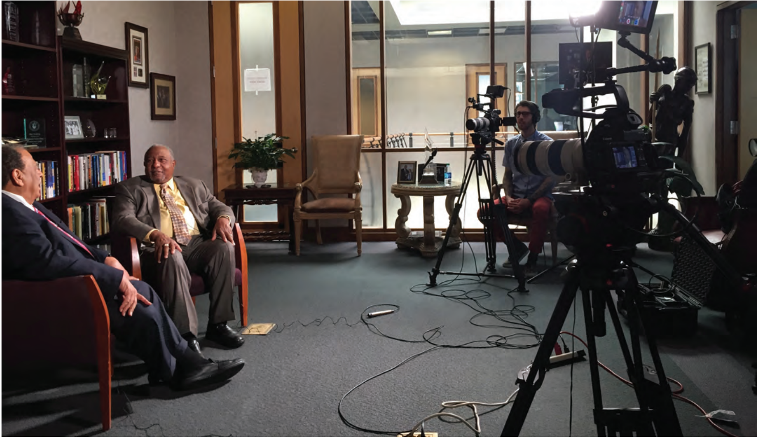
Emory's academic production team records as Bernard LaFayette Jr. (seated, center) interviews fellow civil rights activist Andrew Young Jr. for a segment in his online course From Freedom Rides to Ferguson: Narratives of Nonviolence in the American Civil Rights Movement .