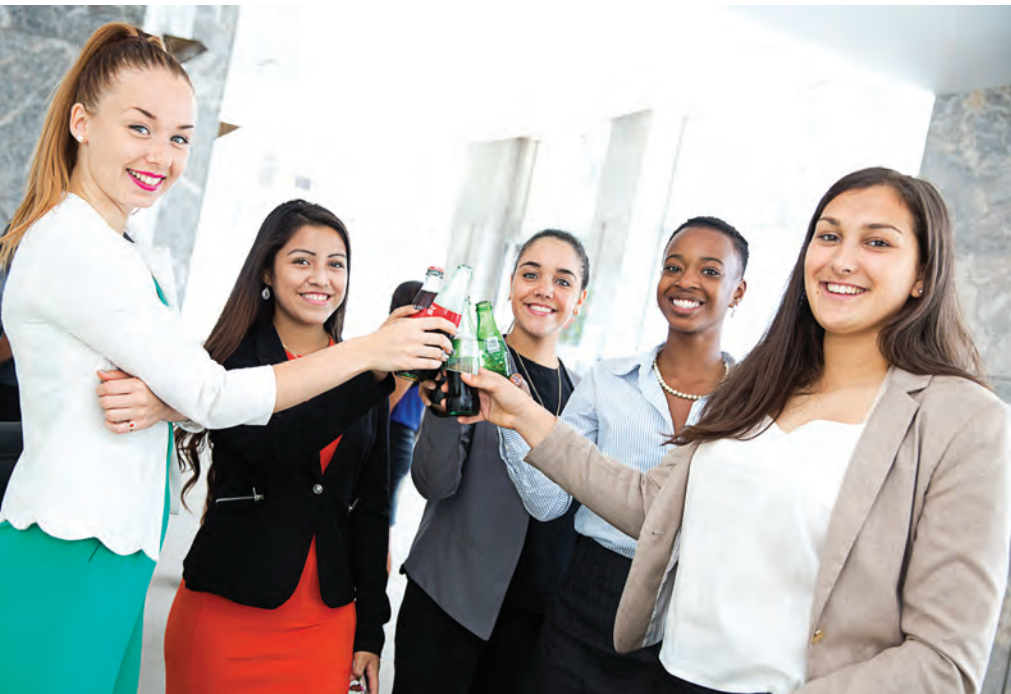
YAB students visited Coca-Cola as part of the training program.