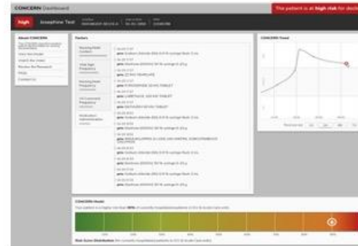
AI-based patient monitoring dashboard

Sources: Nation's Restaurant News , February 9, 2023; The Wall Street Journal , June 15, 2023